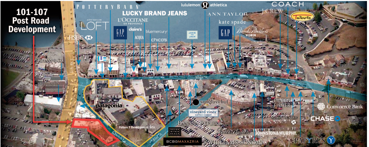
DOWNTOWN WESTPORT MAP