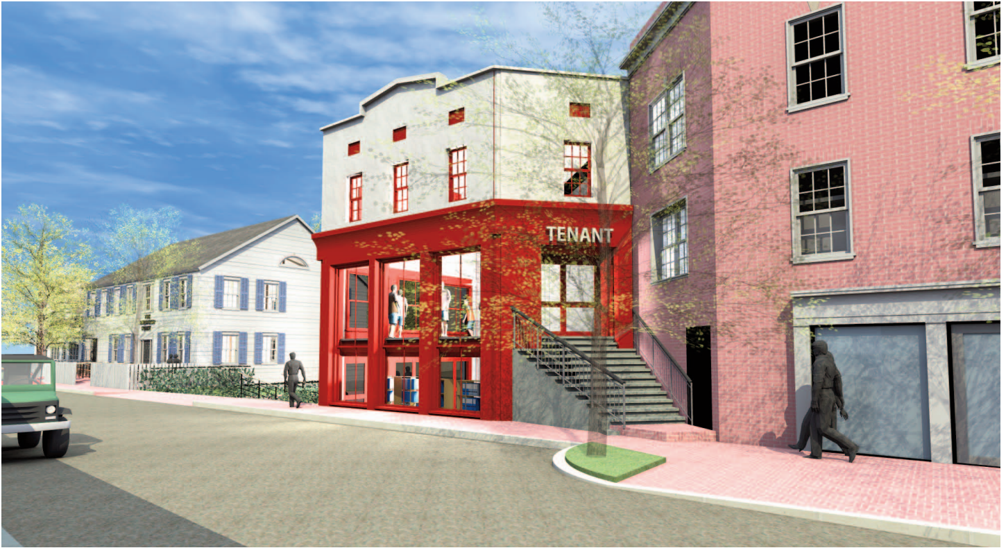
CHURCH LANE FAÇADE